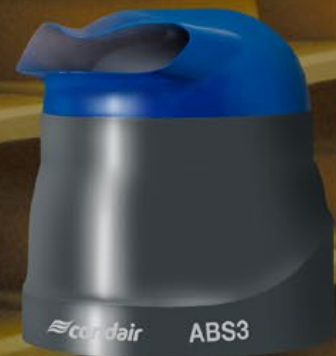
Condair ABS3: Double Strength

The Condair 3001 really comes into its own in industrial and commercial premises with a room volume of 500 m 3 . The deflector hood directs the aerosol mist exactly where you require it, as the outlet can be continuously adjusted. The Condair 3001 is equipped with a manually-filled tank, or fully-automatic operation is also possible (i.e. by connecting it to the mains water supply). The thermal overload switch deactivates the unit if the water level drops too low, ensuring maximum operating safety.