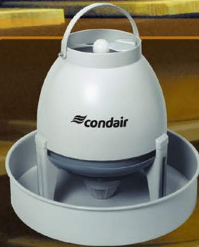
Condair 3001: Maximum safety

Horizontal or vertical? The deflector hoods supplied with this compact atomiser enable individual direction of a fine aero-sol mist absolutely free of droplets. The unit can be cleaned with a minimum of effort, and you can decide whether you wish to connect your Condair 505 to the mains water supply or, alternatively, utilise the manually-filled water tank.